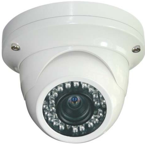
SONY 700TVL Solution Effio-E + 673 CCD With OSD